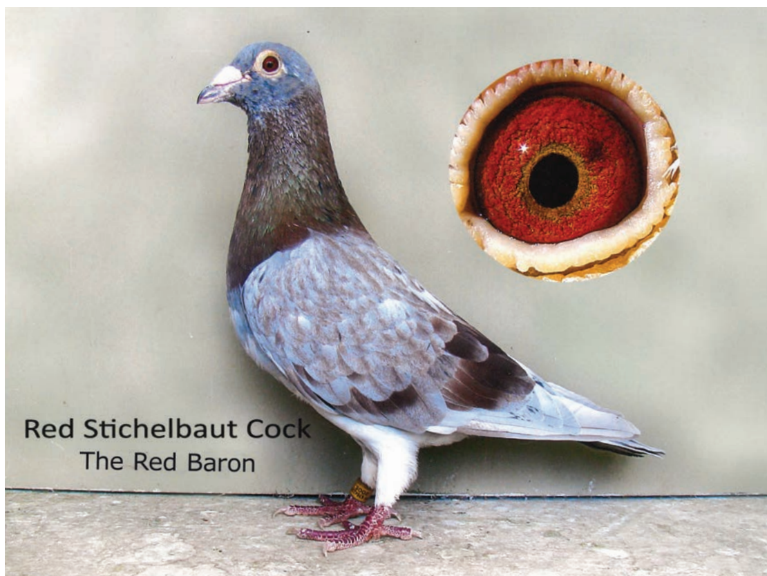
Red Stichelbaut Cock The Red Baron

These pigeons are not just in Club racing, they are racing against the best flyers in Australia in Open races.